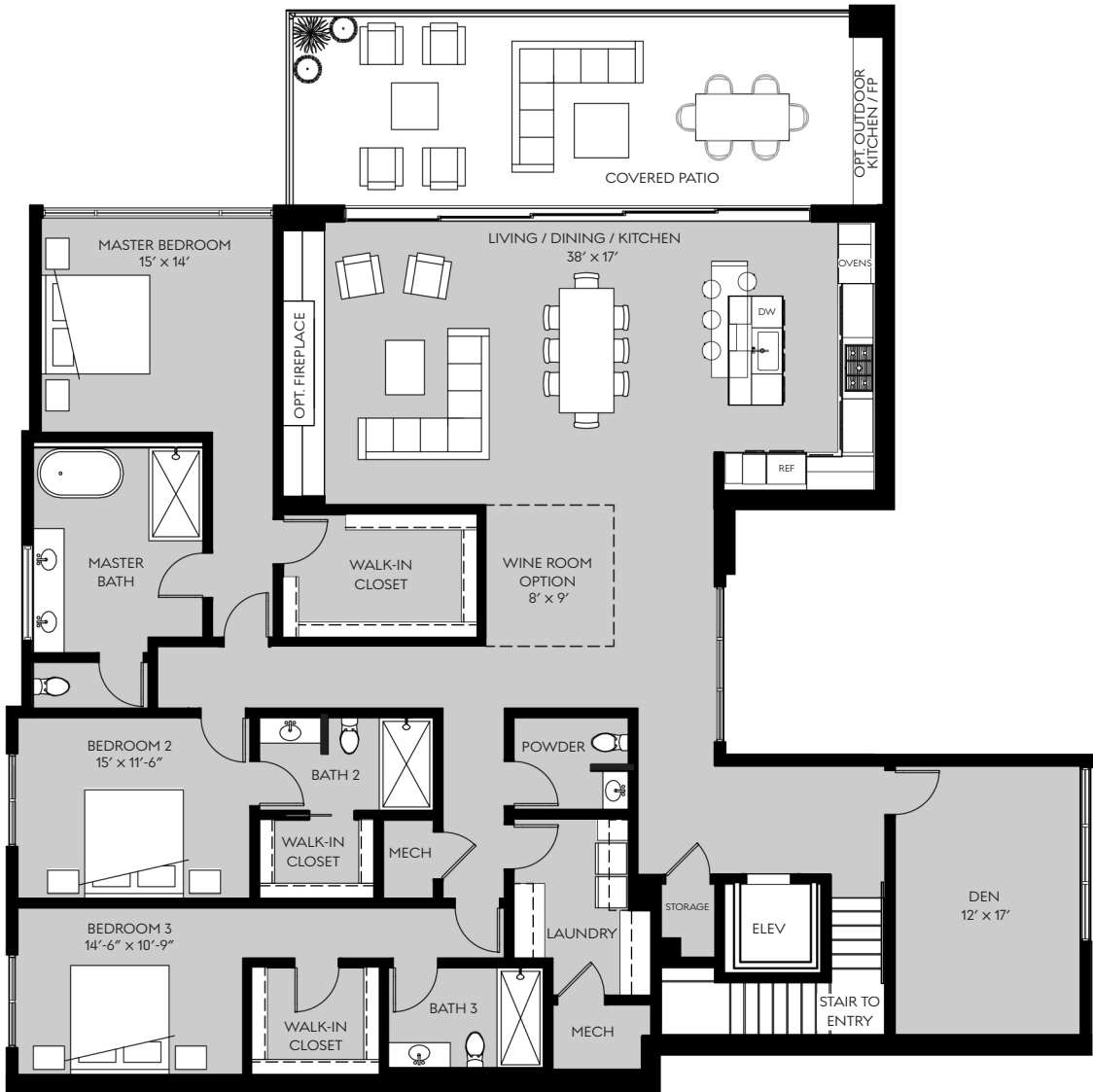
UPPER LEVEL - MAIN LIVING AREA