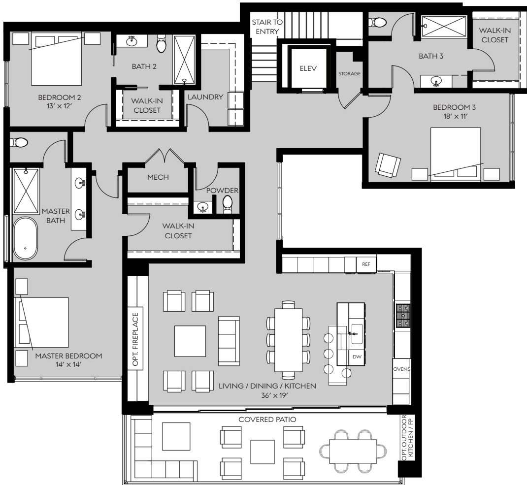
UPPER LEVEL - MAIN LIVING AREA