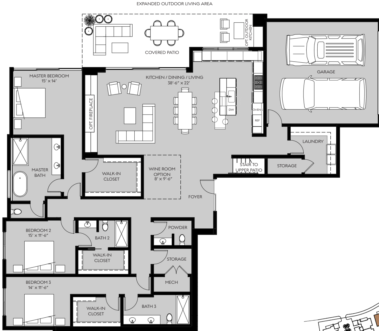
GROUND FLOOR - MAIN LIVING AREA