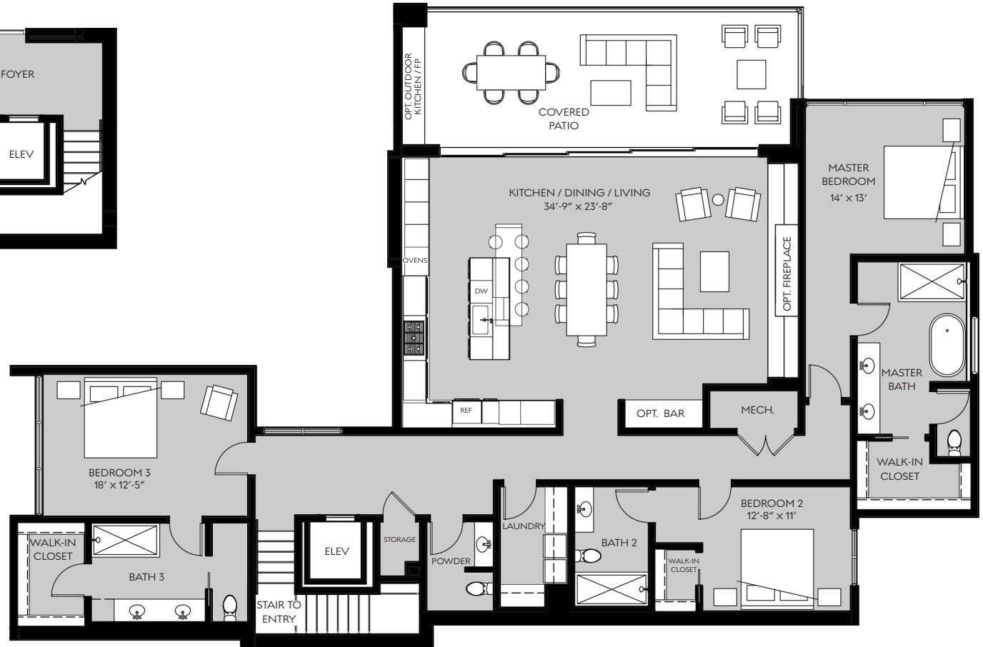
UPPER LEVEL - MAIN LIVING AREA