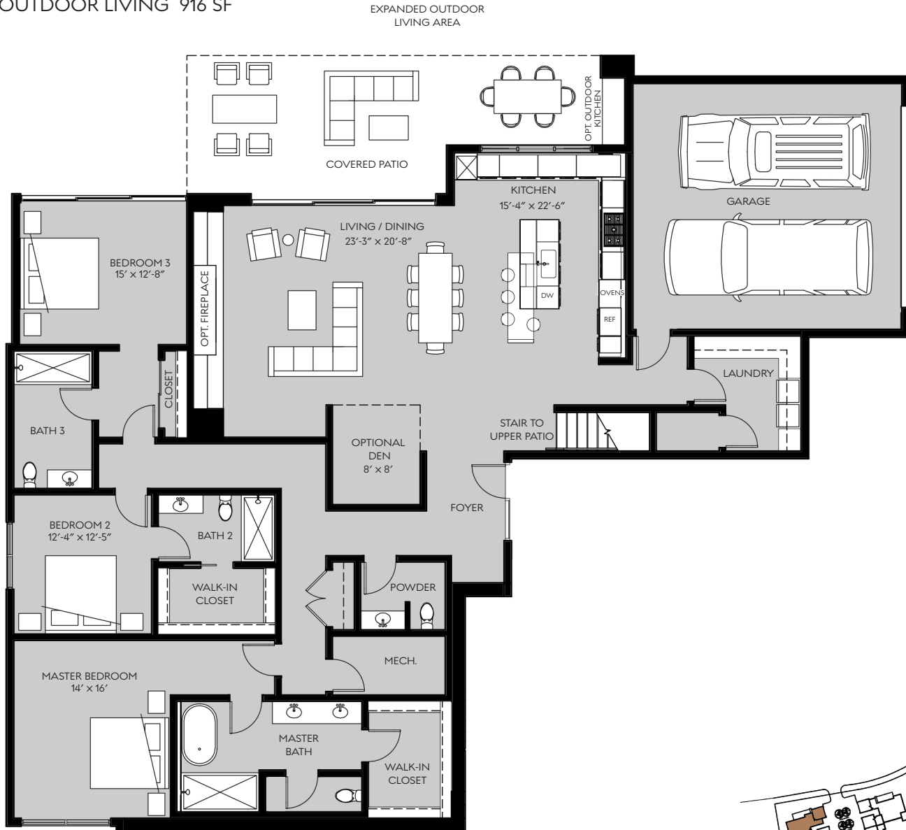
GROUND FLOOR - MAIN LIVING AREA