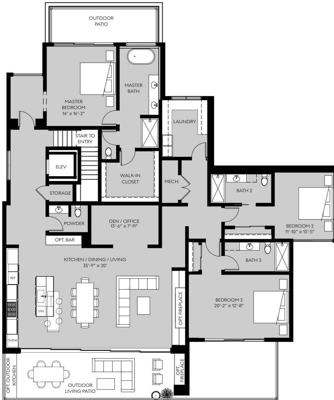
UPPER LEVEL - MAIN LIVING AREA